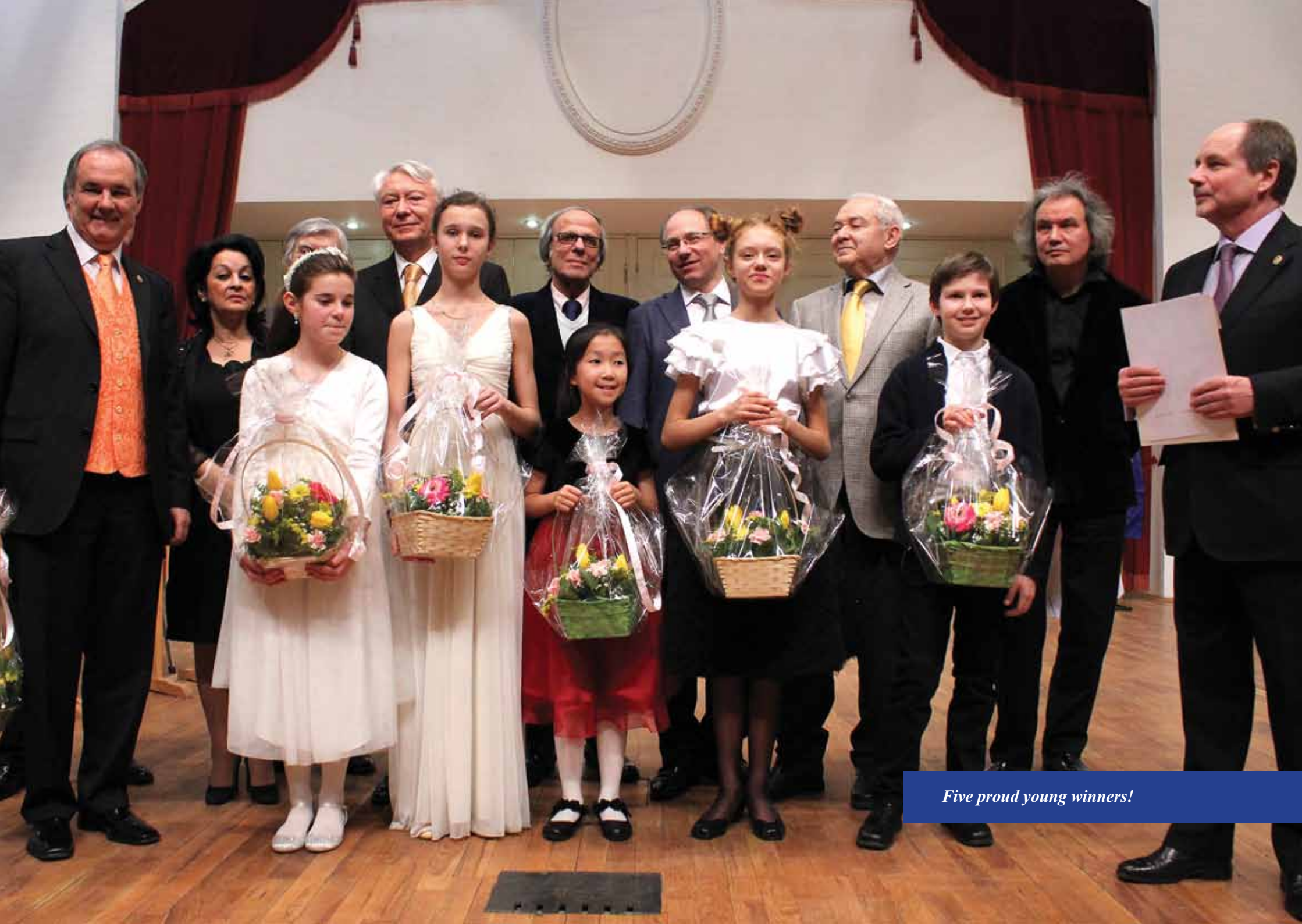
Five proud young winners!