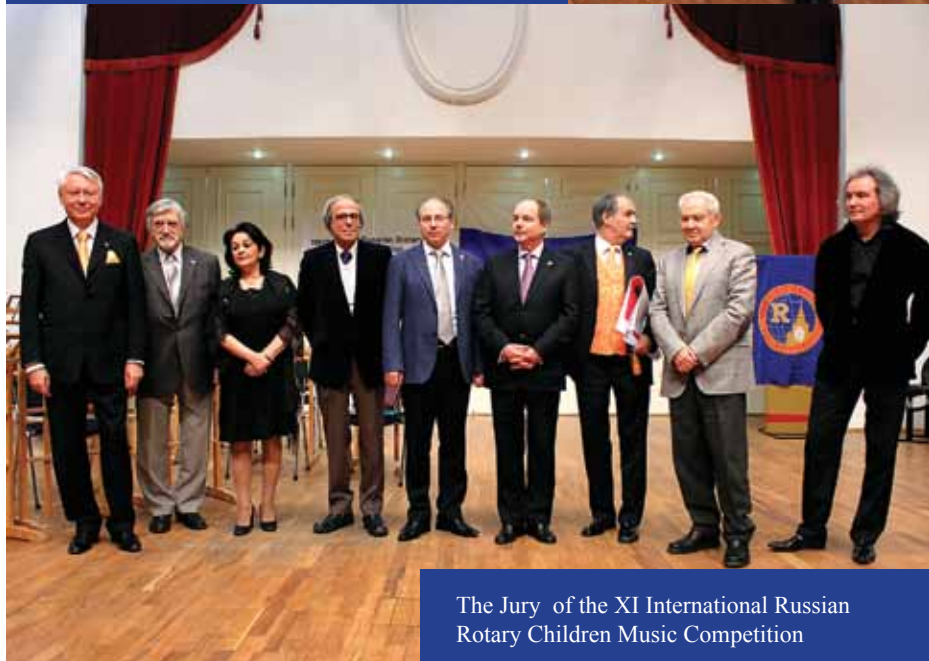
The Jury of the XI International Russian Rotary Children Music Competition