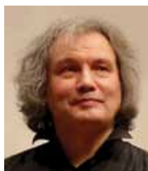
MIKHAIL KHOKHLOV Russia

Former Ambassador of the European Commission in Moscow / Russian Federation 1996-1999, Minister of European and Federal Affairs in Saarland, Politician