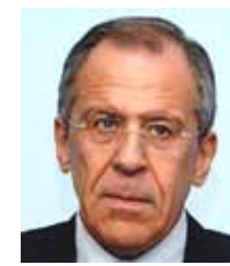
SERGEY LAVROV Russia

National Artist of the USSR, Conductor of "Moscow Virtuosi" Orchestra