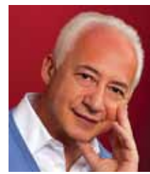
VLADIMIR SPIVAKOV Russia

Professor ABOP RF, Paul Harris Fellow, Founder of the International Russian Rotary Music Competition, Past President RC Moscow International, Board member of OAO TMK