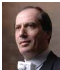
PAVEL KOGAN Russia

Member of the Russian Academy of Arts, Recipient of the Order of Merit of Russia, Peoples' Artist of Russia, Conductor and director of the Moscow State Symphony Orchestra (MSSO).